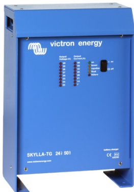
Skylla Charger 24 V 50 A