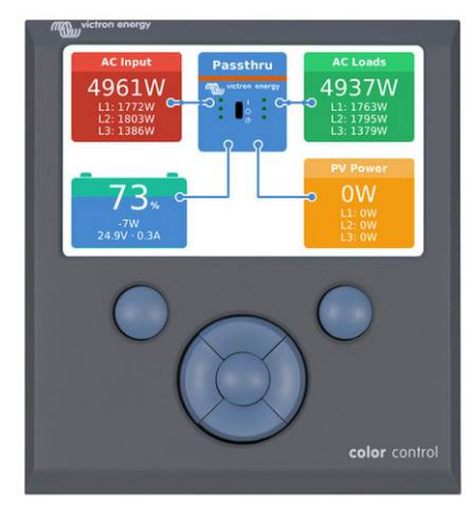
Color Control panel, showing a PV application

When connected to the Ethernet, systems with a Color Control panel can be accessed and settings can be changed.