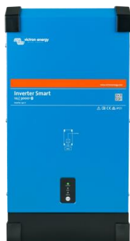
Inverter Smart 12/3000