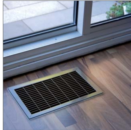
KICKSPACE® Floor model.